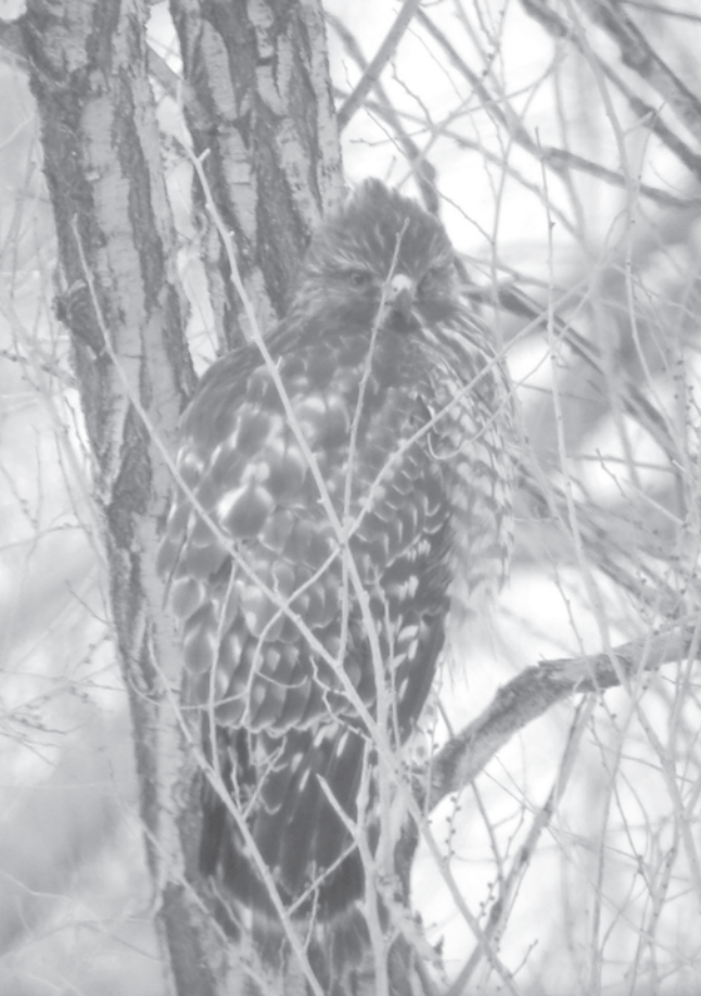
Red-shouldered Hawk at Ogden Nature Center.