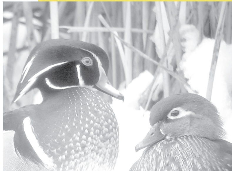
Wood Ducks on Teal Pond.