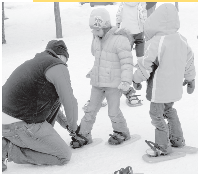
Gearing up to hit the trails.