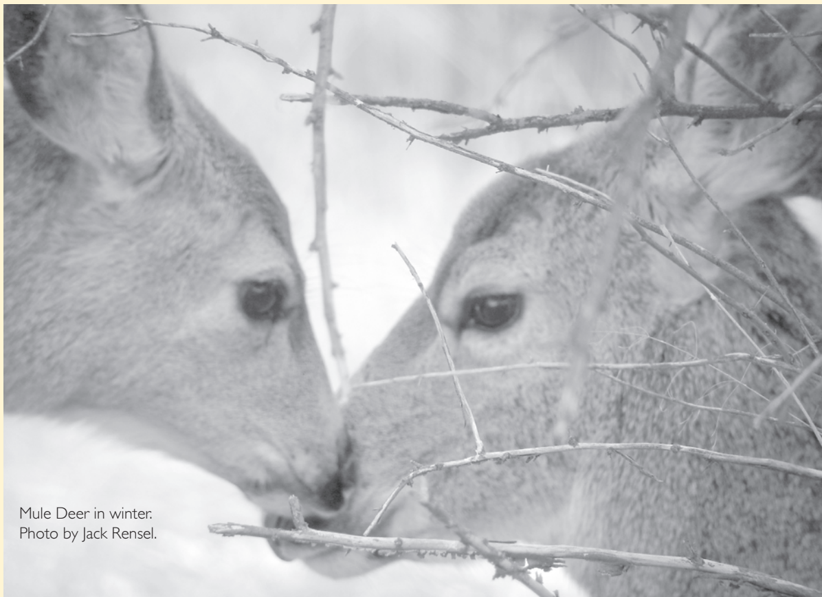
Mule Deer in winter: Photo by Jack Rensel.